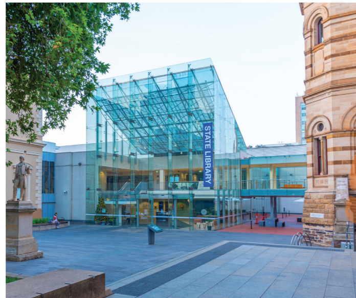
State Library Forecourt